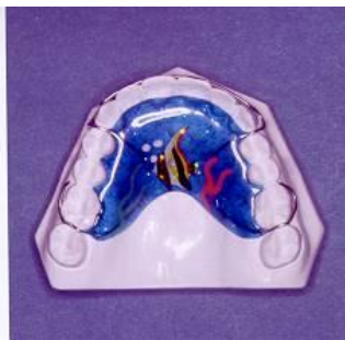
REMOVABLE (Hawley) UPPER or LOWER 6 mos full-time, 1 yr nights