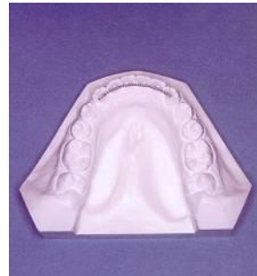
FIXED OR BONDED LOWER ONLY