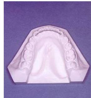
FIXED OR BONDED LOWER ONLY