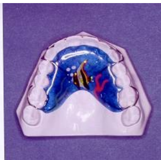
REMOVABLE (Hawley) UPPER or LOWER 1 yr full-time, 1 yr nights